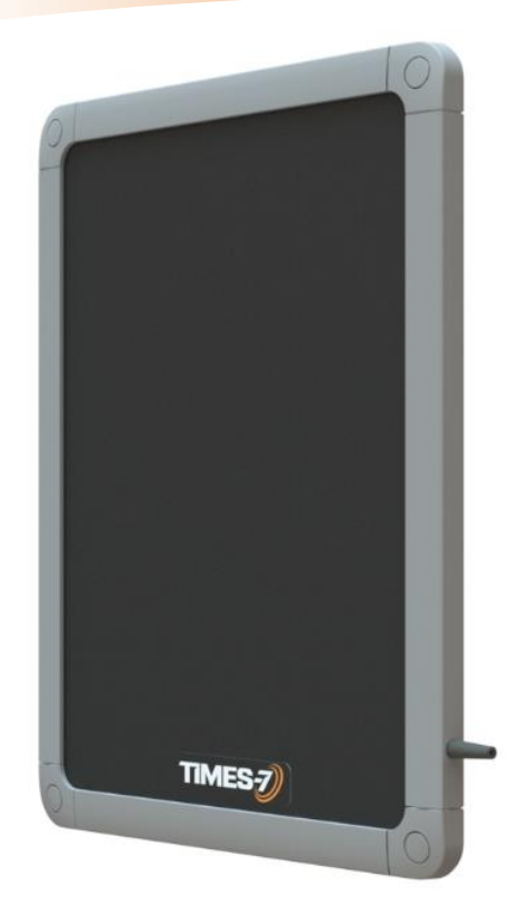
A6031 Circularly Polarized Antenna

Part of the SlimLine range of multi-purpose antennas, the A6031 Circularly Polarized Antenna is an ultra-low profile flat panel antenna for UHF RFID applications in customer-facing or space-conscious environments. With a 4m / 13ft. read range, the A6031 is similar in size and weight to a Tablet PC and can easily blend into any office or retail environment.